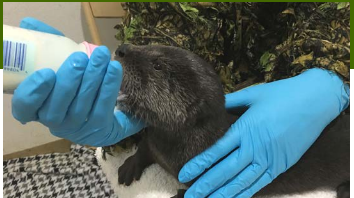
ACCESS TO CORRECT DIETS