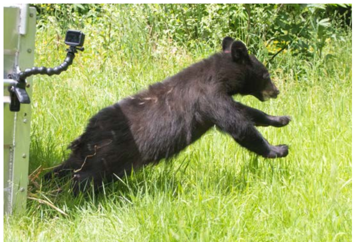
ENSURE SURVIVAL IN THE WILD