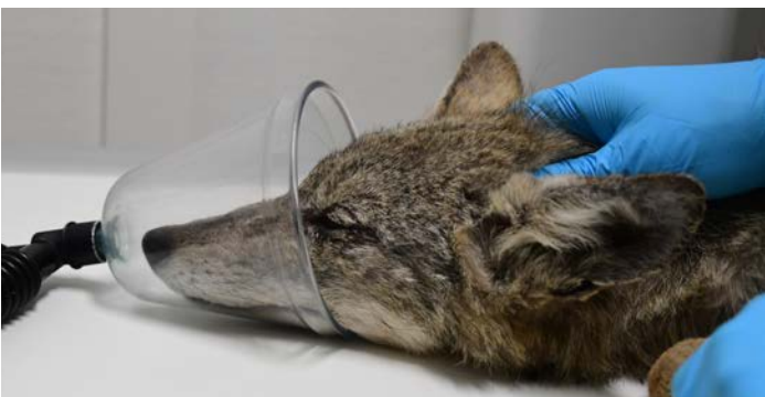
RELIEF FROM SUFFERING